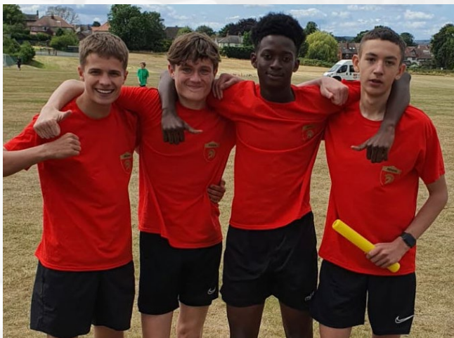
An Athens relay team confident of victory on Sports Day