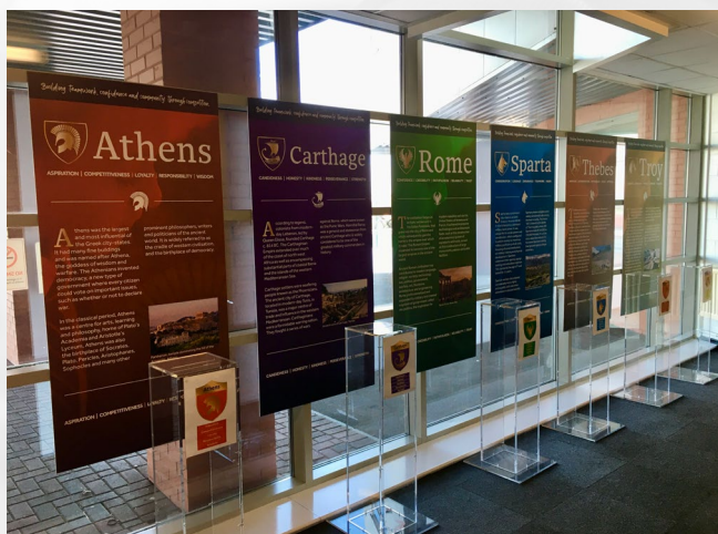
The submission point for the 'box entry' competitions near reception

An online quiz is available to complete every week, as well as a fortnightly paper-based 'box task' (with students posting their entries into the boxes in the school reception). Both challenges are often linked to events like World Book Day or Careers Week. Points are awarded to the best entries.