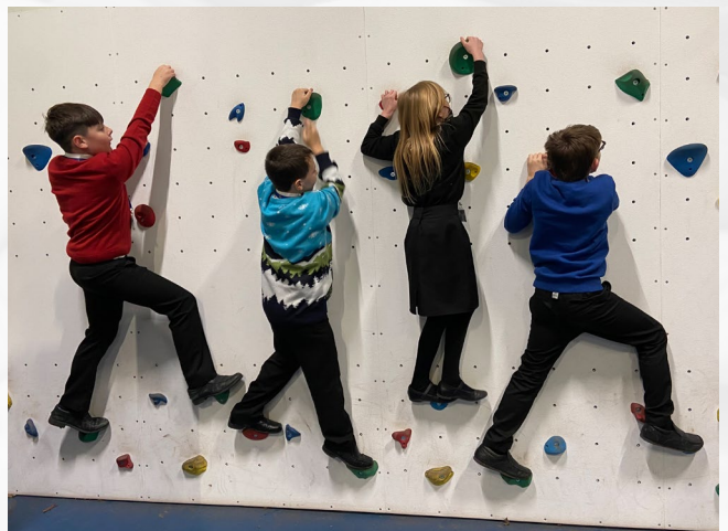
A festive house climbing wall event... in Christmas jumpers