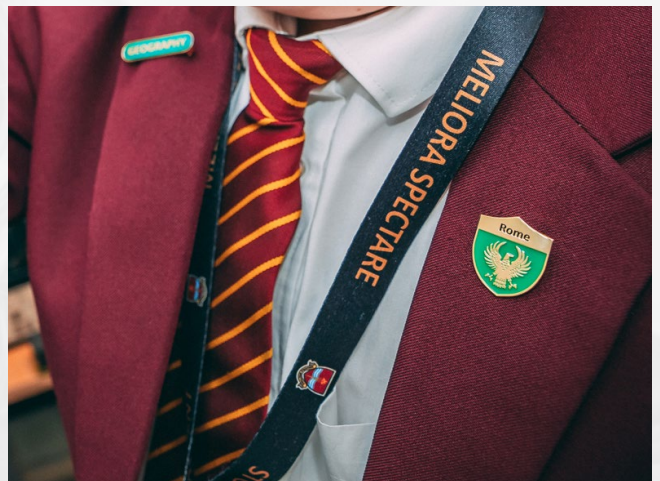
House badges are part of the school uniform

House captains are elected from Year 12 students. They help organise house events and gain valuable leadership experience for their UCAS applications or CVs.