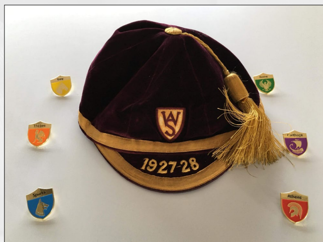
The 'sorting hat' used to allocate students to houses in their first assembly

Guest speakers are often invited to speak at these assemblies, often about a house value.