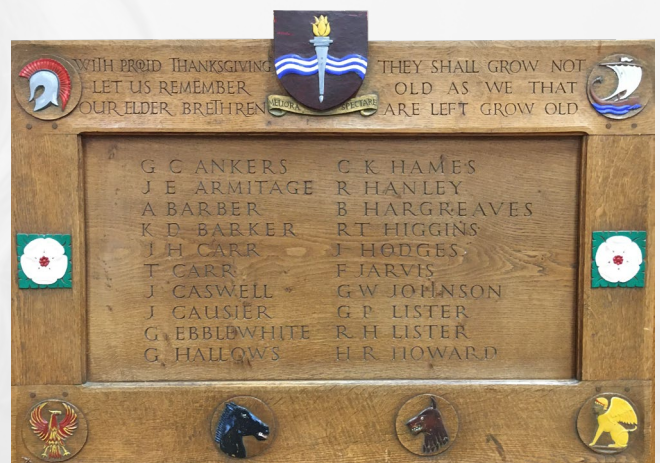
Above: Part of the school's war memorial, which includes the badges of all six houses

Today, the house system has been modernised for the 21st century, but is still built on the same sense of community envisaged by the school's founders.