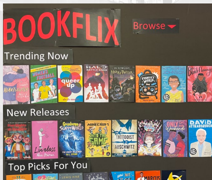
The 'Bookflix' display in the new library