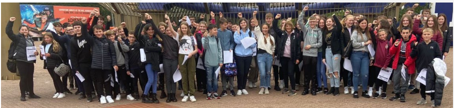
Athens students at Alton Towers as a reward for winning the House Cup 2021–2022