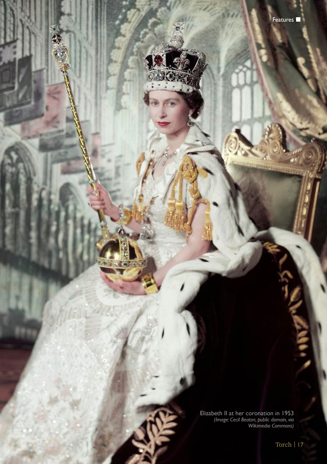
Elizabeth II at her coronation in 1953