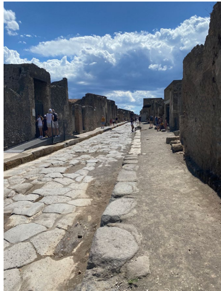
Pompeii, destroyed by a volcanic eruption

After visiting Mount Vesuvius, we followed up with a trip to Pompeii. Pompeii was a popular trading city that had a population of 12,000 prior to the eruption. After the devastating eruption, the majority of the population was wiped out, leaving a thick layer of ash covering the entirety of Pompeii for centuries.