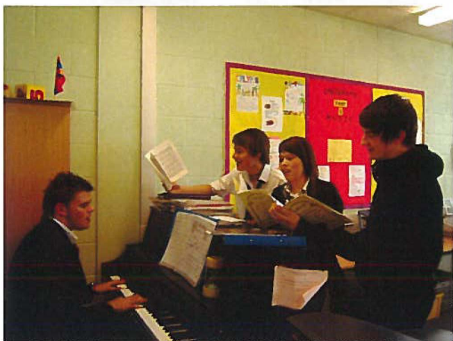
Some of the cast learning the songs!

They have all been doing exceptionally well, keep up the good work!