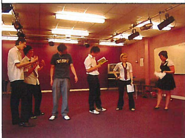
'Grease' chorus singers rehearsing!