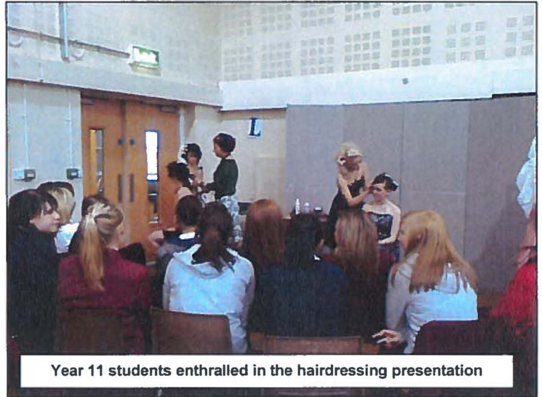
Year 11 students enthralled in the hairdressing presentation

Using hair straighteners they demonstrated curling techniques, that when added by fantastic accessories such as flowers and Swarovski crystals for the hair, will ensure that the girls will look a million dollars on the night!