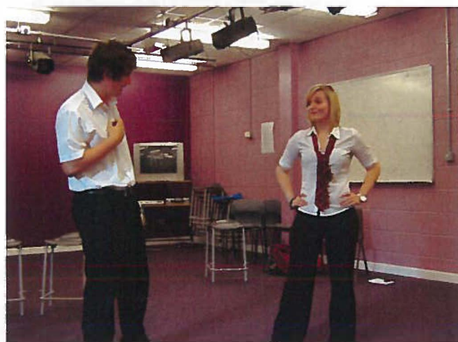
Danny and Sandy at a heated moment in the musical!