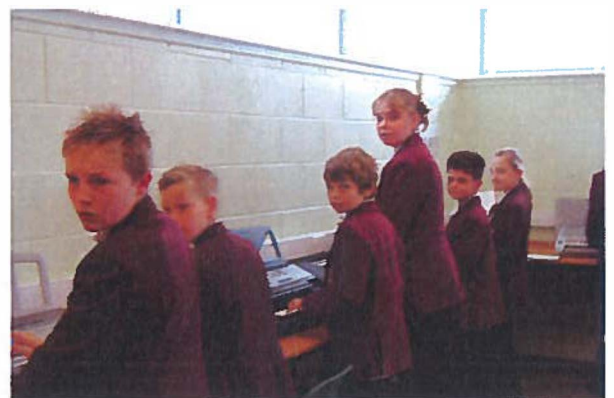
Some of the members of 'Keyboard Club'