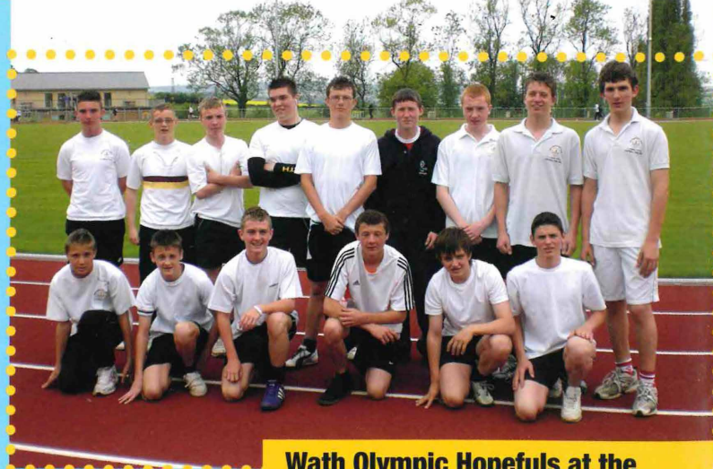
Wath Olympic Hopefuls at the English Schools Athletics Cup