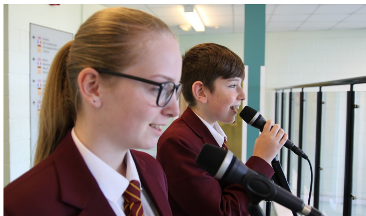
Buskers on the Balcony