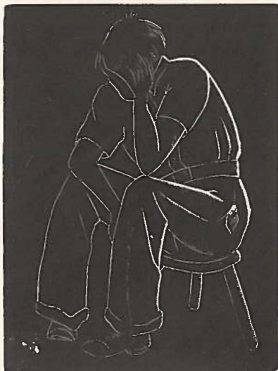
Woodcut BOREDOM by A. DUNN, 5 B