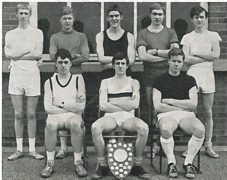
Cross Country Team