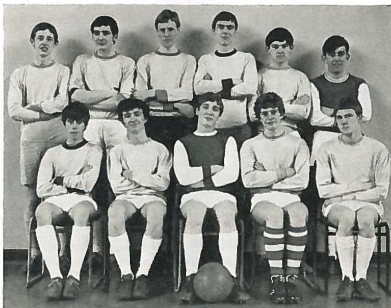
1st XI Football