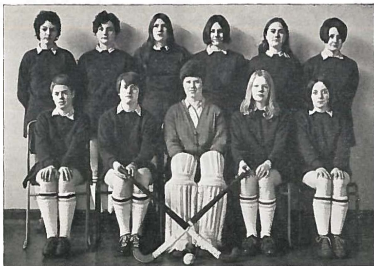
1st XI Hockey