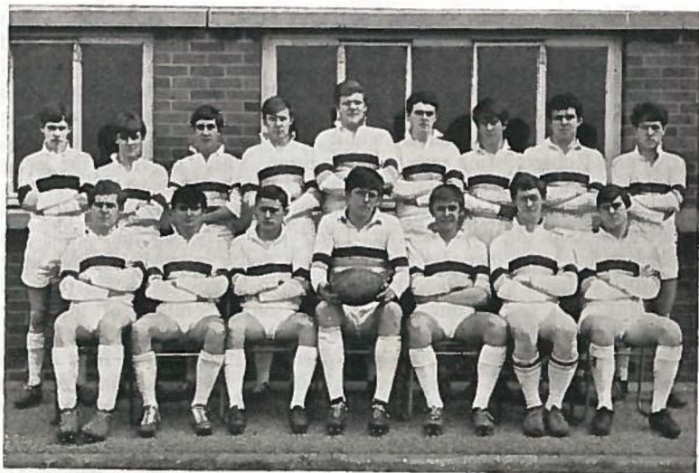
1st XV Rugby