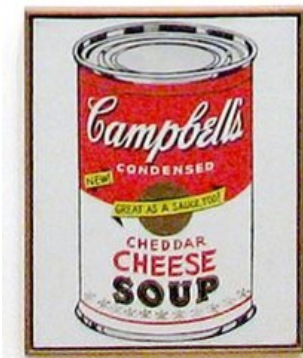
The Cheddar Cheese canvas from

Andy Warhol's Campbell's Soup Cans , 1962.